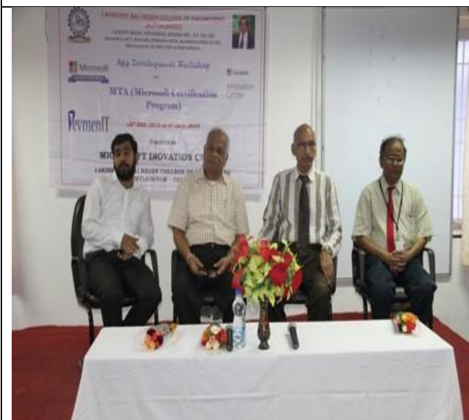
Resource Person & Faculty in the event