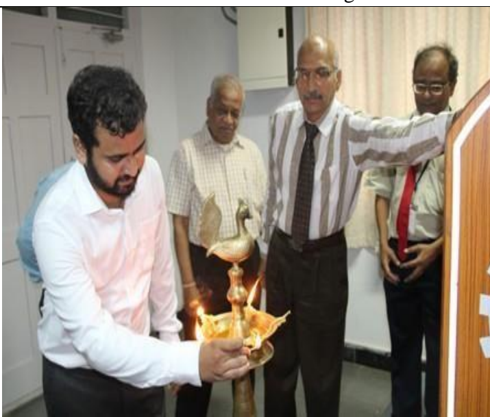
Resource Person Inaugurating the Event